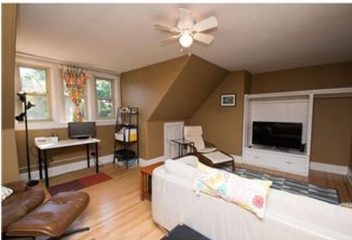
3rd Floor Apartment Living Room