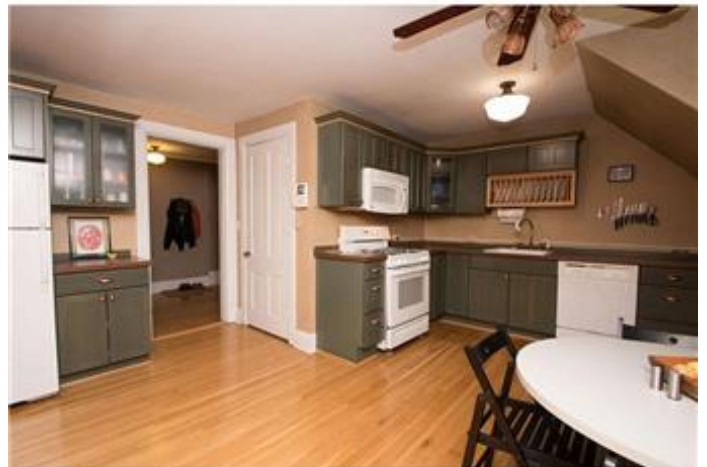
3rd Floor Apartment Kitchen