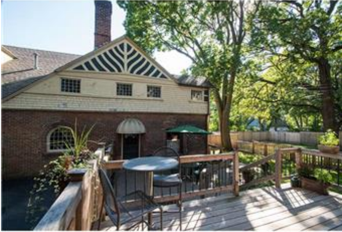
Back Deck and Carriage House.